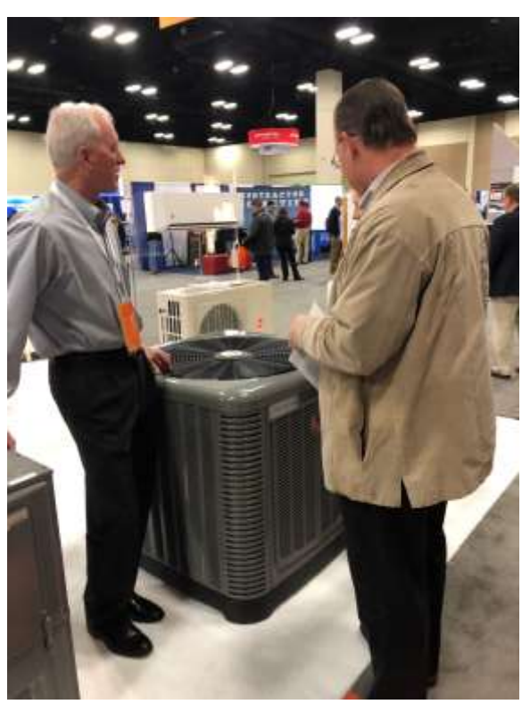
Dub Taylors meets with manufacturers to talk HVAC efficiency programs