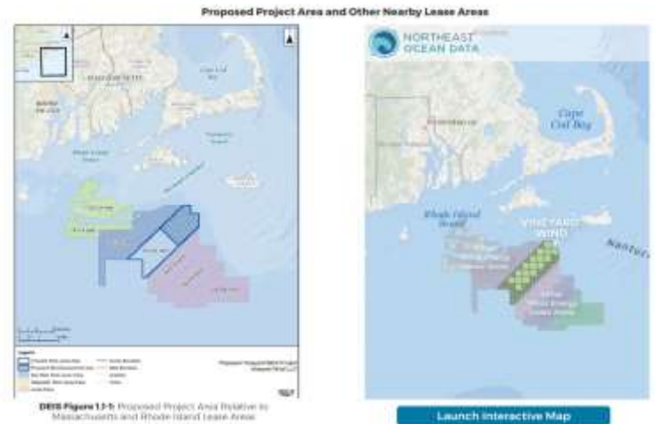
DEIS Figure 12-5: Proposed Project Area Relative to Massachusetts and Rhode Island Lease Areas